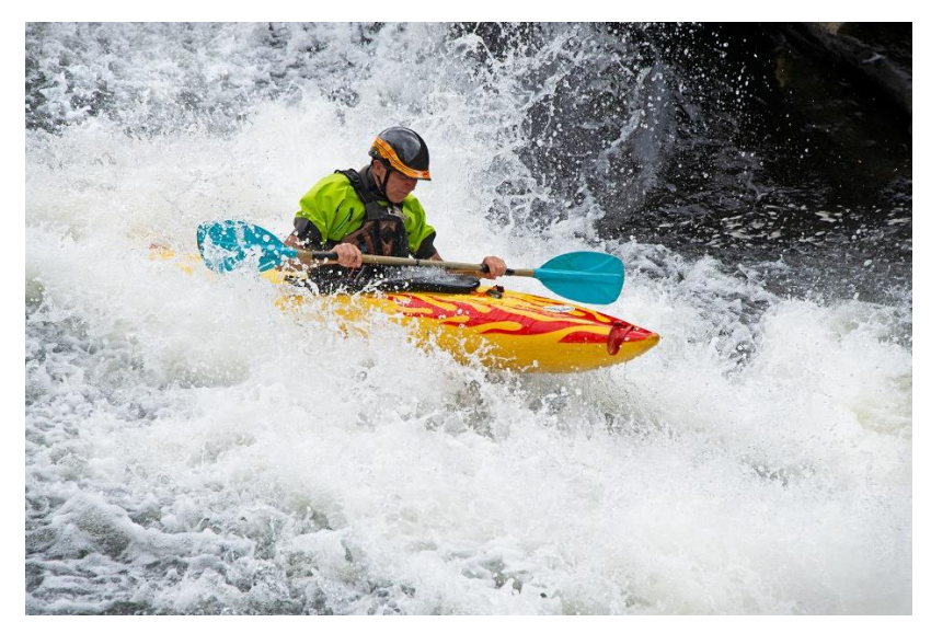
Staying loose over the cheese grater rocks before the final curler