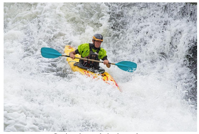
Setting the angle in the curlers