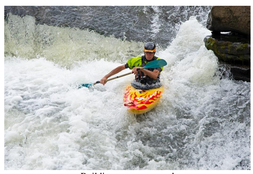
Building up some speed