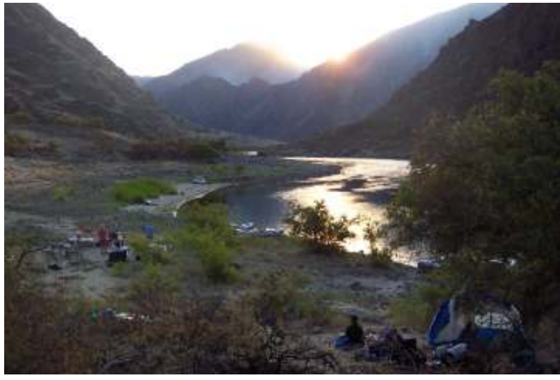
Sunrise at the Salt Creek layover camp.

Once the big rapids were out of the way, we turned our attention to finding a good campsite. We were targeting Pine Bar, based on a recwas already occupied. A short