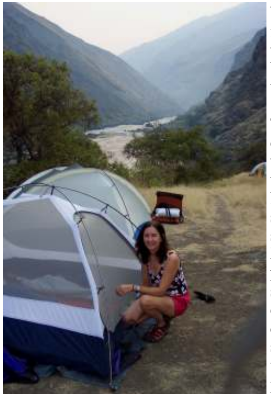
Bridget at the Bernard Creek high bench camp. HELL (Continued from page 7)

Creek. This campsite was better than our first in that it had some marginal tent sites and enough room for our kitchen areas at rive level, but some of us had to climb up to a high bench to find better tent sites. Hell's Canyon is marked by a number of high bars or benches, marking deposition by floodwaters from the catastrophic draining of glacial Lake Bonneville to scout at the close of the last Ice Age. The three power dams upstream of the put-in hold back modern sediment, so there are few sand bars at river level. The lower campsite at Bernard Creek was full of dark. volcanic rocks that held the heat well into the evening. The effort to number haul tents up to the high bench was rewarded by a great view downstream and flat, grassy terrain cooled by evening breezes. Just across Bernard Creek from the high see all the bench is the McGaffee Cabin, built way to