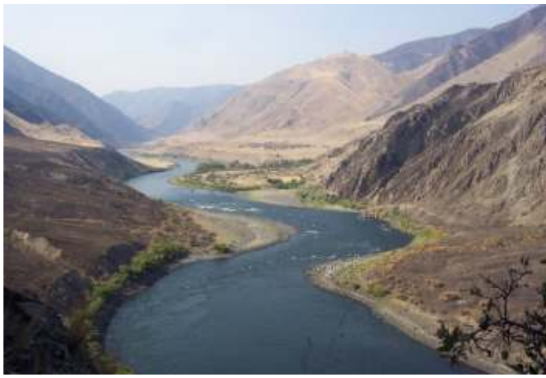
View upstream from the Suicide Point hike.

Most of the group relaxed in the shade or in the water during the heat of the afternoon. A large tarp was rigged between some trees, extending the shaded area to ac-