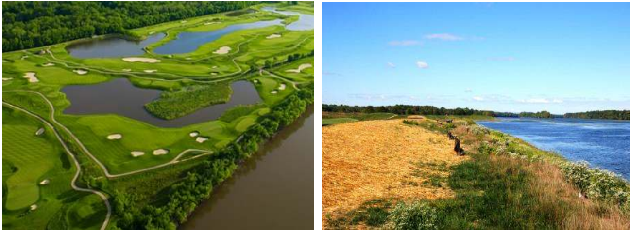
Trump National Golf Club: Before and After

Earlier this summer, Trump National Golf Course cut down more than 450 trees on the Virginia shoreline of the Potomac. Once protected, the now treeless land is now vulnerable to erosion and flooding. Unfortunately, unless the stumps are replaced with mature trees immediately, the damage over a rough winter will be hard to repair.