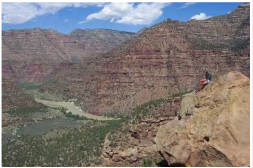
The view from Chicken Rock, upstream toward camp.