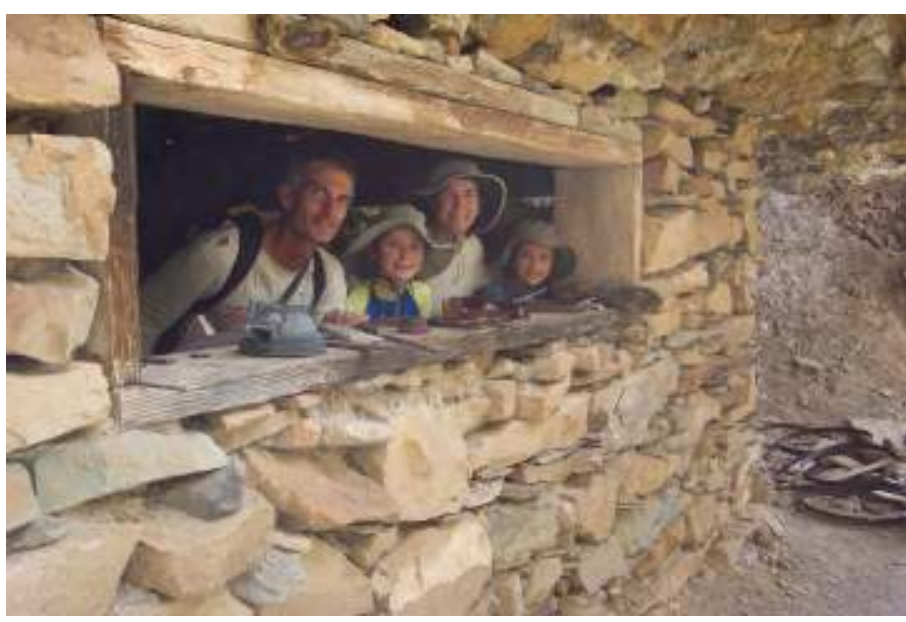
The Fico's in the bootlegger's cabin.

the ME solo, then tandem with Canyon after paddling four miles small side canyon just upstream to the "bootlegger's cabin," mentioned in the guidebooks and recommended by Bob Kimmel. We held a permit (separate from the BLM's) to camp on the Indian reservation, and it also specifically allowed this side hike (but not hiking in general). The "cabin" is actually a rough rock-walled shelter