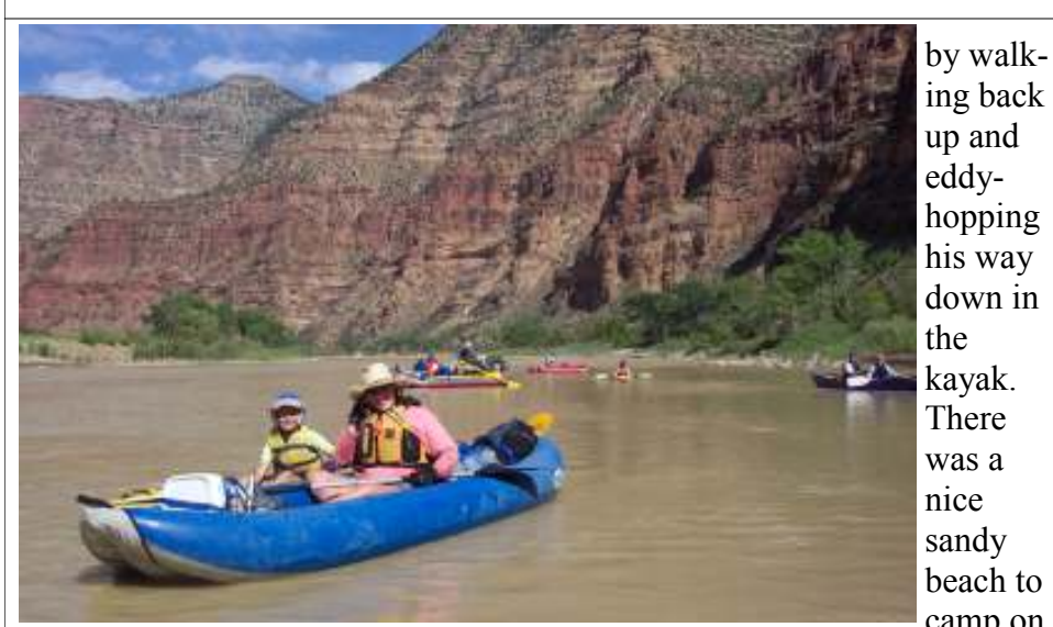
The group approaching Three Canyons.