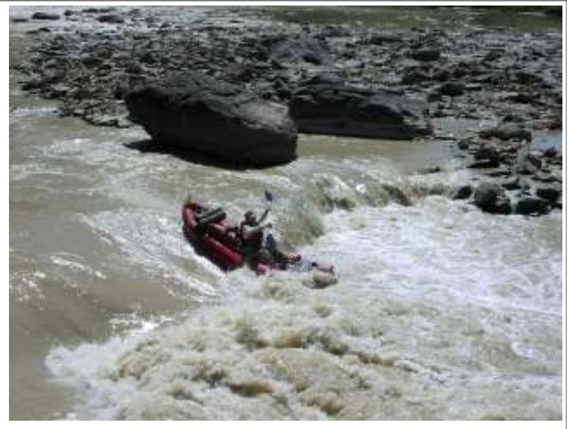
Ron punches the top hole at Three Fords

about a half mile Rattlesnake on river left. with a view across the river at a reminiscent of Seneca Rocks. It was not ideal,