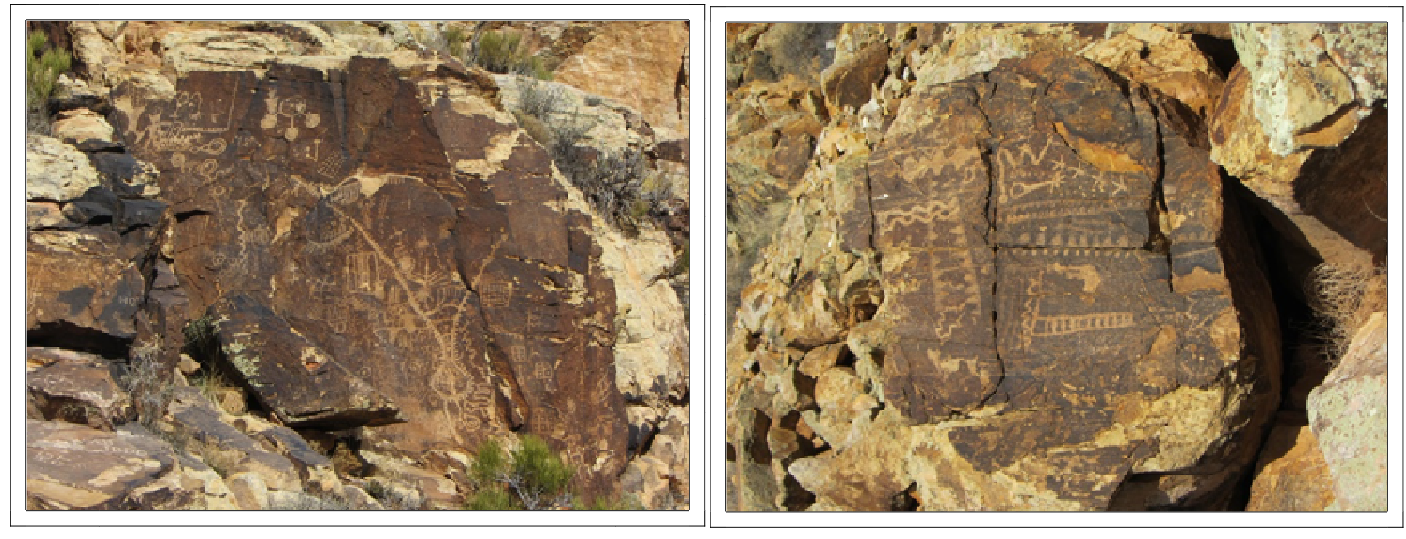
Parowan Gap petroglyphs