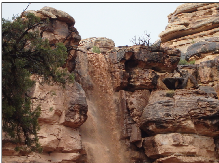
Red Canyon flash flood waterfall.

2/3rds of the river. This was in the canyon where we were hiking only an hour previously.