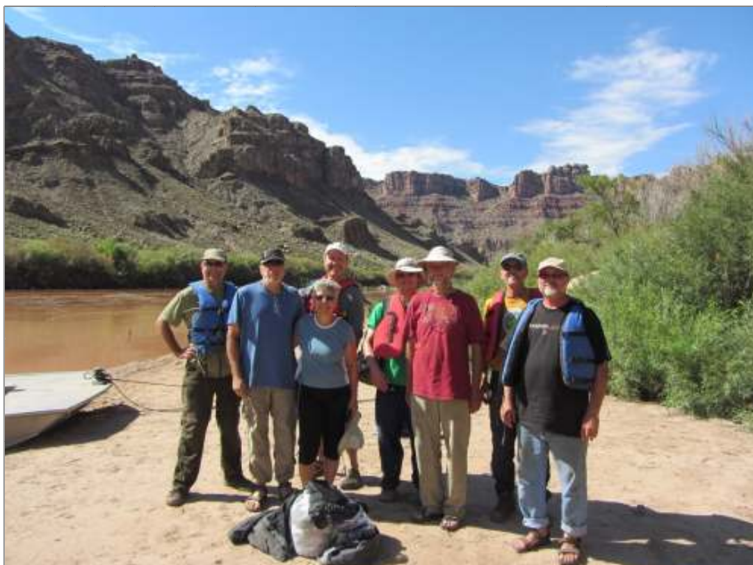
Group at Spanish Bottom camp.

than one would think. May is a great month for backpacking; September is good for float trips. We will be back.