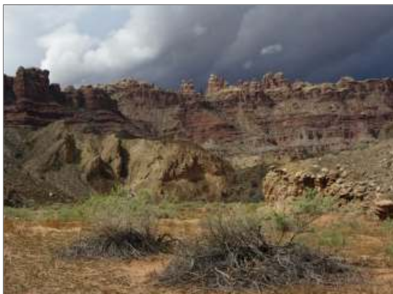
Storm over the Doll House.

That night we had a humdinger of a storm with huge lightning bolts and thunderclaps reverberating around the canyon walls. Jo's commentary: I was counting in between the lightning bolts and thunderclaps as the storms moved away and new ones headed our way. In the short spaces where I drifted off to sleep, I was dreaming of floating down Cataract Canyon in my tent or on the blow-up beds we were sleeping on. Not much sleep that night worrying about the river rising around us.