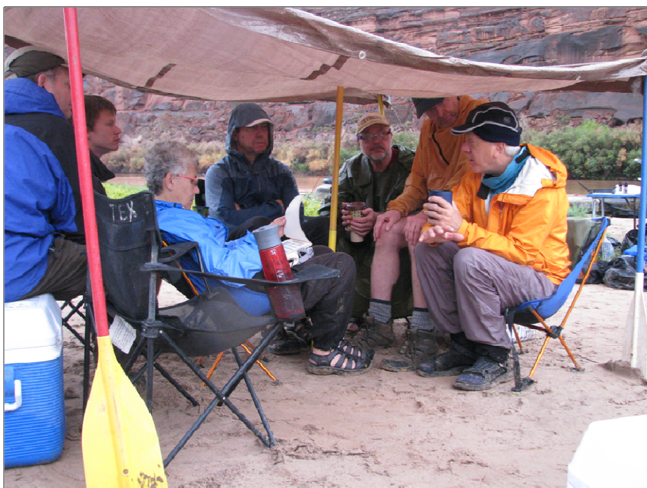
First camp under the tarp.