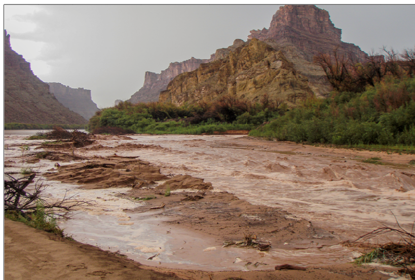
...creating new island in Colorado River.