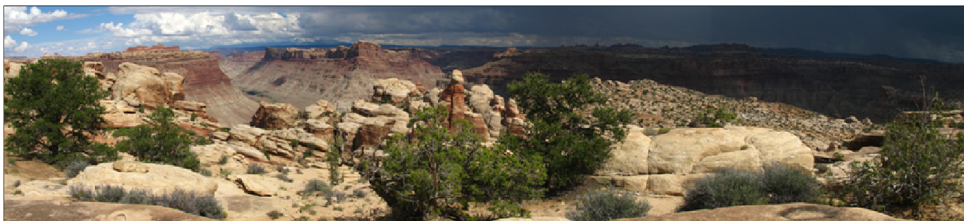
View from the Doll House.