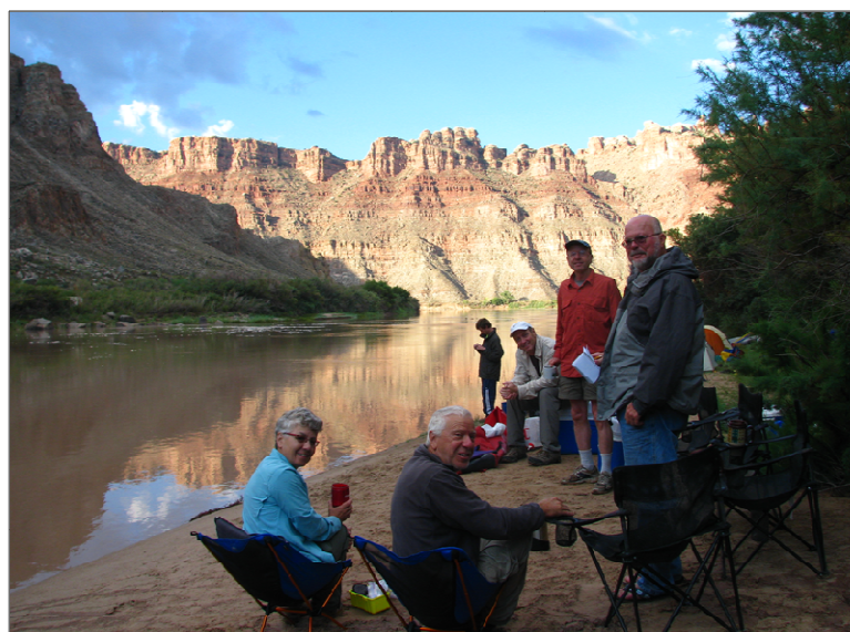
Spanish Bottom camp.

We camped at Spanish Bottom for 3 nights. There are numerous opportunities for hiking here: Needles, Confluence Overlook, Cataract Canyon, the Doll’s House and beyond into the Maze. The next day was a fine one, so we decided to hike to the Doll’s House. We walked to the “lower” Spanish Bottom campsites across huge mud pans and cave-ins from storm damage and the resulting flash floods. It was a hell of a hike up — 1500 feet on narrow but very well built and maintained trails zig-zagging up the canyon side. The top of the canyon was breathtaking with amazing rock formations, thus the name Doll’s House bestowed on the area by cowboys in the 1890s. We reached a fine overlook of the Needles and