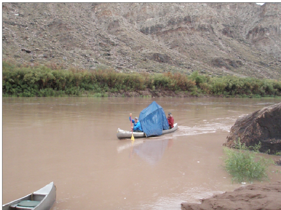
Jo and Bob moving a tent from our flooded campsite.